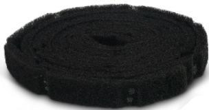
Profile Vent Ridge Vent 3" x 25"

--- Material de Ventilación Profile Vent