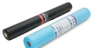
Synthetic Roof Underlayment Roof Commander & Palisade Premium 1000 sq ft roll