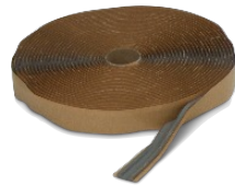
Double Bead Butyl Tape (7/8" x 3/16" x 40')