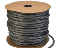
Backer Rod Reduces oil canning, especially on flat pan and pencil rib profiles