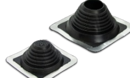
Pipe Boot (Various sizes, heat treated & retro fit also available)

--- Bota de Tubo (Diferentes tamaños, tratado térmicamente, )