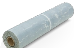
Ice & Water Shield Underlayment Peel & Stick 200 sq ft roll (3' x 66')