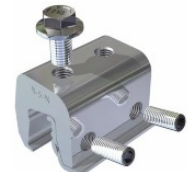
S-5 Clamp Mount anything to standing seam

--- Bota de Tubo (Diferentes tamaños, tratado térmicamente, )