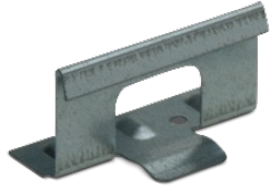
UL90 Panel Clip For Snap Seam

--- Tornillo Para Unión Traslapada Autoperforante